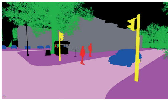
Rendered image (left) and automatically annotated image (right)